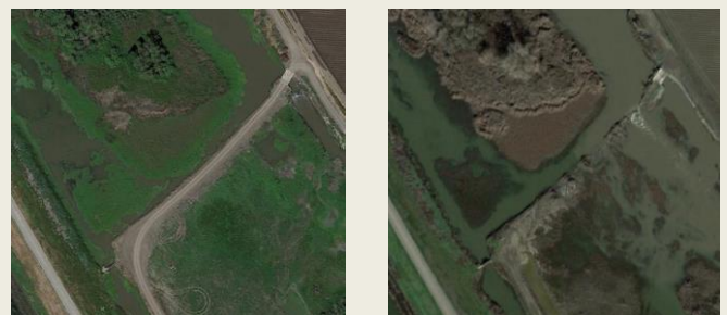
Wallace Weir during the summer (left) and winter (right)