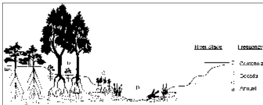
Figure 4. Geomorphic and ecological functions provided by different levels of flow. Water tables that sustain riparian vegetation and that delineate in-channel baseflow habitat are maintained by groundwater inflow and flood recharge (A). Floods of varying size and timing are needed to maintain a diversity of riparian plant species and aquatic habitat. Small floods occur frequently and transport fine sediments, maintaining high benthic productivity and creating spawning habitat for fishes (B). Intermediate-size floods inundate low-lying floodplains and deposit entrained sediment, allowing for the establishment of pioneer species (C). These floods also import accumulated organic material into the channel and help to maintain the characteristic form of the active stream channel. Larger floods that recur on the order of decades inundate the aggraded floodplain terraces, where later successional species establish (D). Rare, large floods can uproot mature riparian trees and deposit them in the channel, creating high-quality habitat for many aquatic species (E).

Flows of low magnitude also provide ecological benefits. Periods of low flow may present recruitment opportunities for riparian plant species in regions where floodplains are frequently inundated (Wharton et al. 1981). Streams that dry temporarily, generally in arid regions, have aquatic (Williams and Hynes 1977)